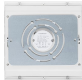
Surface Mount Bracket Included